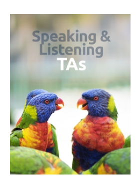
Speaking and Listening: TAs

Covering learning needs such as Gifted & Talented, learning difficulties and behavioural and communication needs.